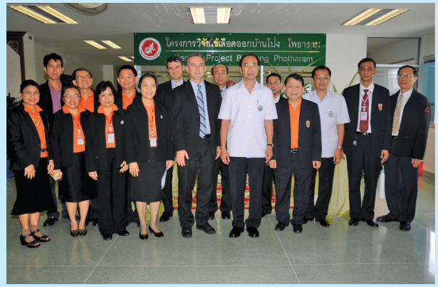
DENGUE PROJECT BANPONG-PHOTHARAM 2011