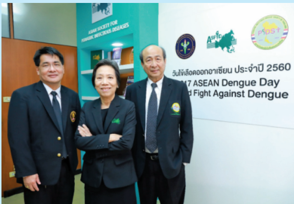
ASEAN DENGUE DAY 2017