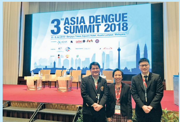
ASIA DENGUE SUMMIT 2018